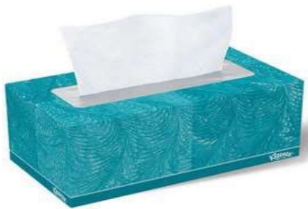
4 boxes Kleenex tissues