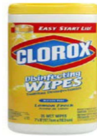
2 tubs of Clorox wipes