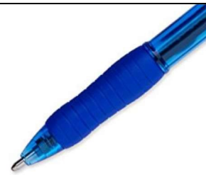
2 ballpoint blue pens