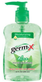
1 bottle of hand sanitizer