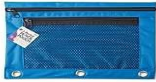
1 pencil pouch