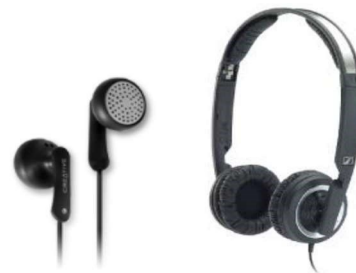
earphones or headsets

*This is very important because we use computers a lot in 3 rd grade*