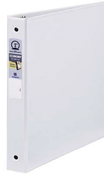
1 inch binder