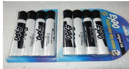
8 Expo brand, low-odor dry erase markers (thick point style)