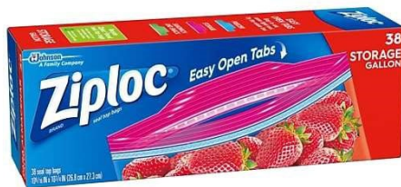
1 box of gallon Ziploc bags