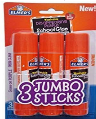
3 LARGE glue sticks