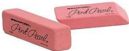
2 pink erasers