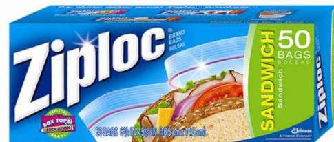
1 box of sandwich Ziploc bags