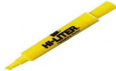
2 yellow highlighters