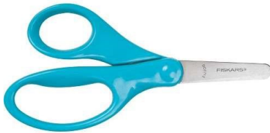
1 pair Fiskars scissors (5 inch)