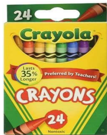
1 box Crayola crayons (24 count)