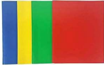
Plastic or laminated mead double pocket folders 6 two-pocket folders (blue, green, red, and yellow)