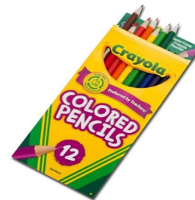
1 box Crayola-colored pencils (sharpened, 12 count)